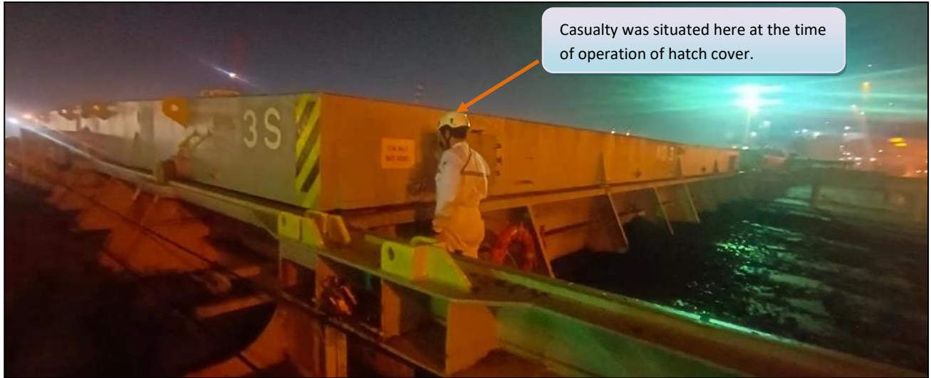
Fig 1: Location of casualty on main deck at the time of incident

This advisory is issued considering the unfortunate incident that occurred recently on board a vessel berthed at a coal jetty at Haldia, resulting in the tragic loss of life onboard a vessel. The investigation revealed that the deceased was neither a seafarer, nor an approved shore personnel engaged in stevedoring tasks on board. Regarding the casualty incident, the Directorate General of Shipping has observed the following: